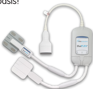
10 cm Paddles

DuoFLEX® allows us to scan patients we previously had to turn away due to coil size limitations, rigid coils and/or positioning challenges. With the DuoFLEX® paddles' 8-channel-count, the improved signal capability allows the technologists to shorten scan times. This is helpful for patients having difficulty with pain or keeping still in the MRI scanner. The increased SNR allows for reduction in the acquisition times, while keeping superb diagnostic quality images. The DuoFLEX® coil suite brings value to our patients, technologists and radiologists on a consistent basis!