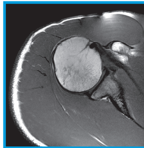
24 cm Paddles