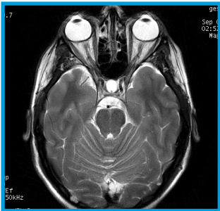
24 cm Paddles

At our site DuoFLEX® has facilitated for high image quality, versatility, and speed of scanning and we are using the Suite on a 12x GE scanner. These coils are capable of scanning almost anything you put them to. We use them for female pelvis exams, hips, brachial plexus, brain, TMJ's and muskloskeletal imaging. DuoFLEX® coils are outstanding coils!