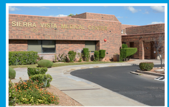
Sierra Vista Diagnostics

The GE Excite HD system was provided and is serviced by BC Technical, who services the latest MRI systems from all major vendors.